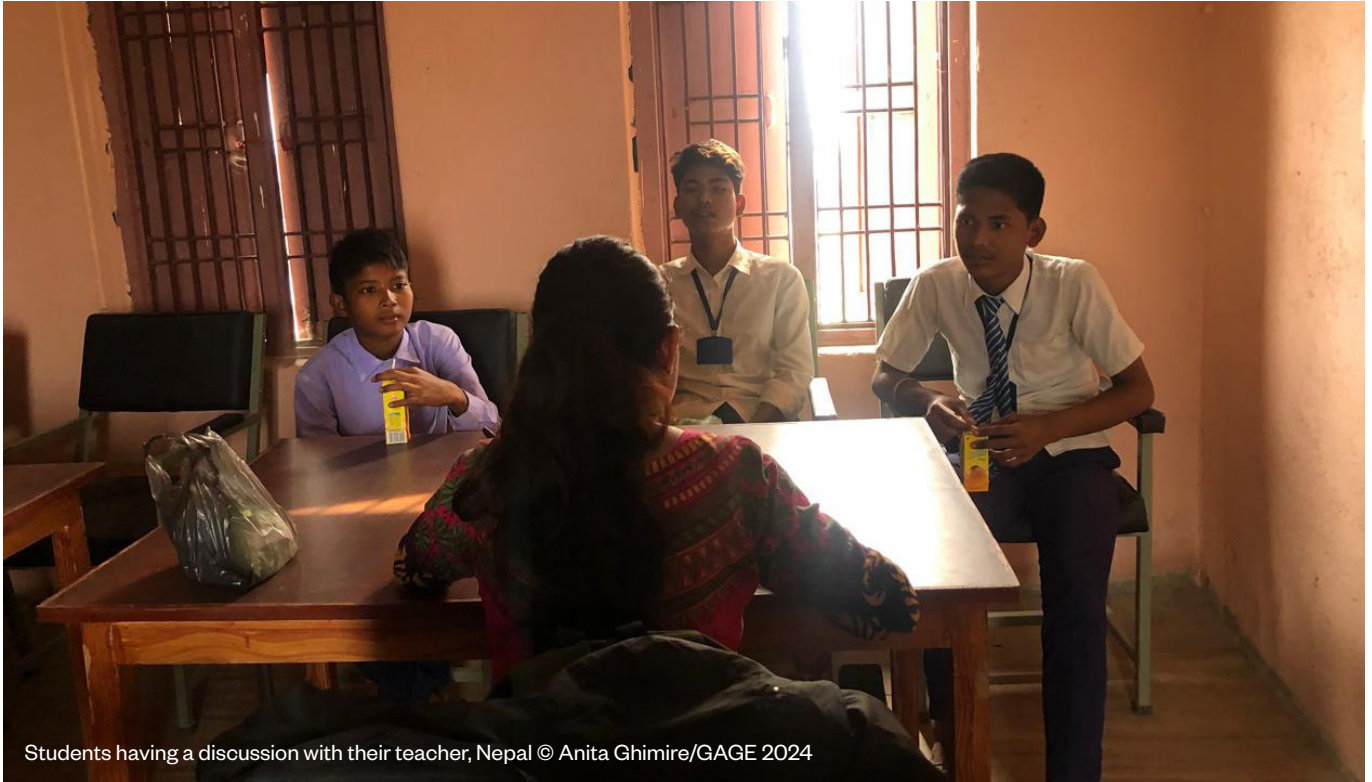
Students having a discussion with their teacher, Nepal

In 2023, the number of girls from treatment group who fully agreed that they can talk to strangers decreased to 49% and increased to 49% in the control group.