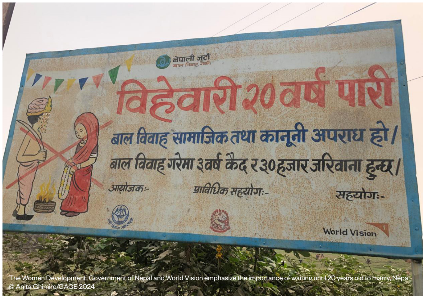
The Women Development, Government of Nepal and World Vision emphasize the importance of waiting until 20 years old to marry, Nepal

years. By midline, girls' knowledge had improved; just 3% of the treatment group and 7% of the control group thought that the minimum legal age for a girl's marriage was below 20 years.