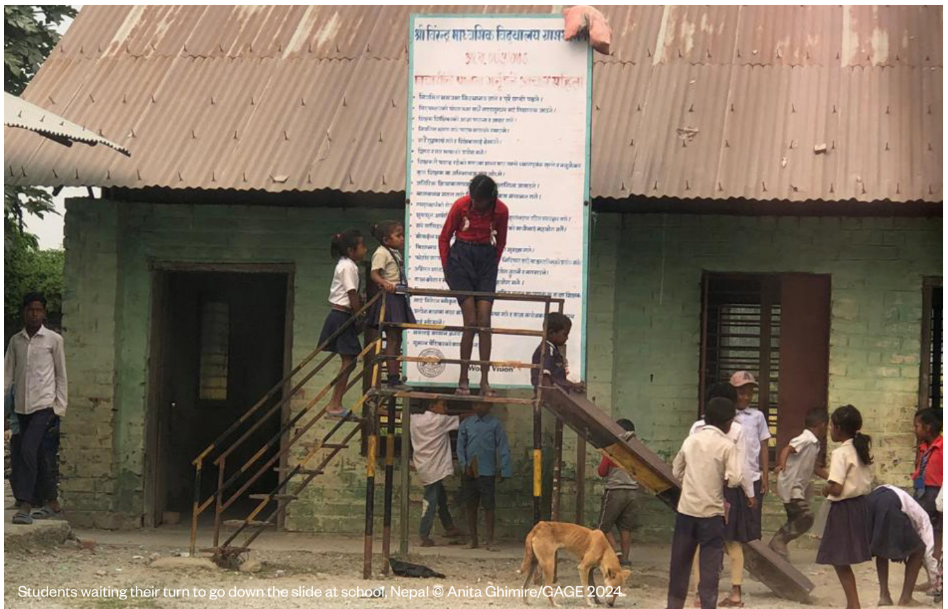
Students waiting their turn to go down the slide at school, Nepal

Overall, at baseline, 70% of adolescent girls from the treatment group and 65% from the control group fully agreed (and 24% and 29% respectively partly agreed) that they are a pleasant person. By midline, in 2023, there was