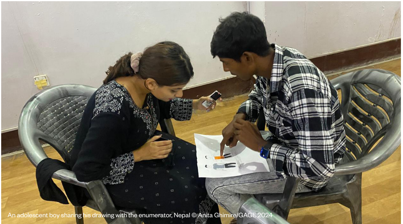
An adolescent boy sharing his drawing with the enumerator, Nepal