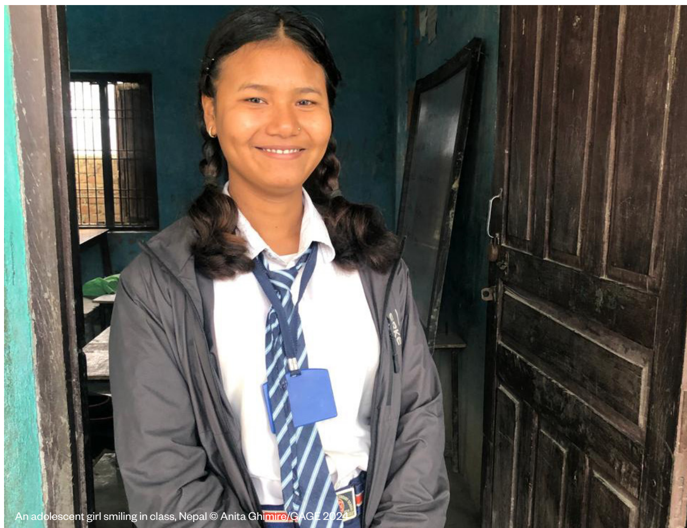
An adolescent girl smiling in class, Nepal

economic skill-building training. At midline, 10% of the treatment group and 3% of the control group were involved in such programmes.