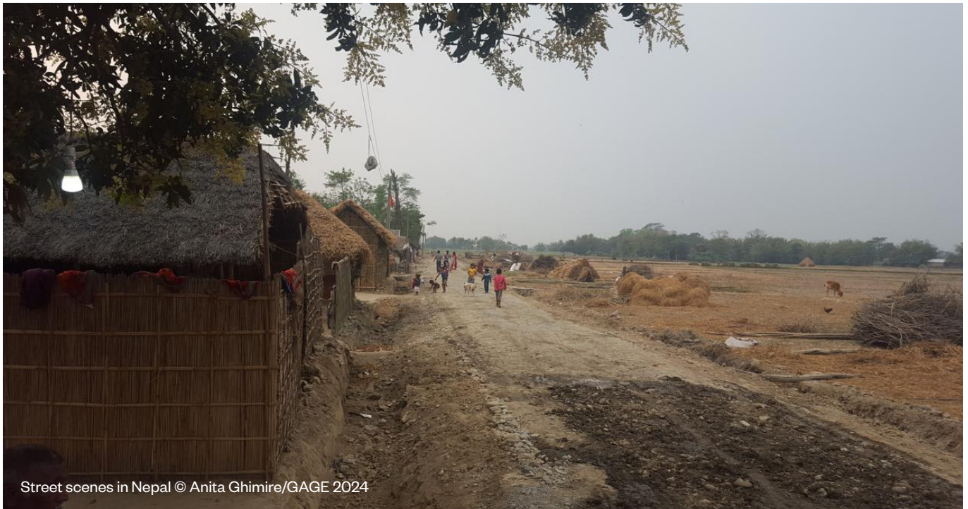
Street scenes in Nepal

to the need for more work around social norms and positive masculinity. Similarly, almost a third (30%) of girls still agreed that a man should be able to provide everything for his family. There was no change in the proportion of girls who believe it is more important for boys than girls to get an education, while 11% of girls in the treatment group still agreed that boys should have more free time than girls.