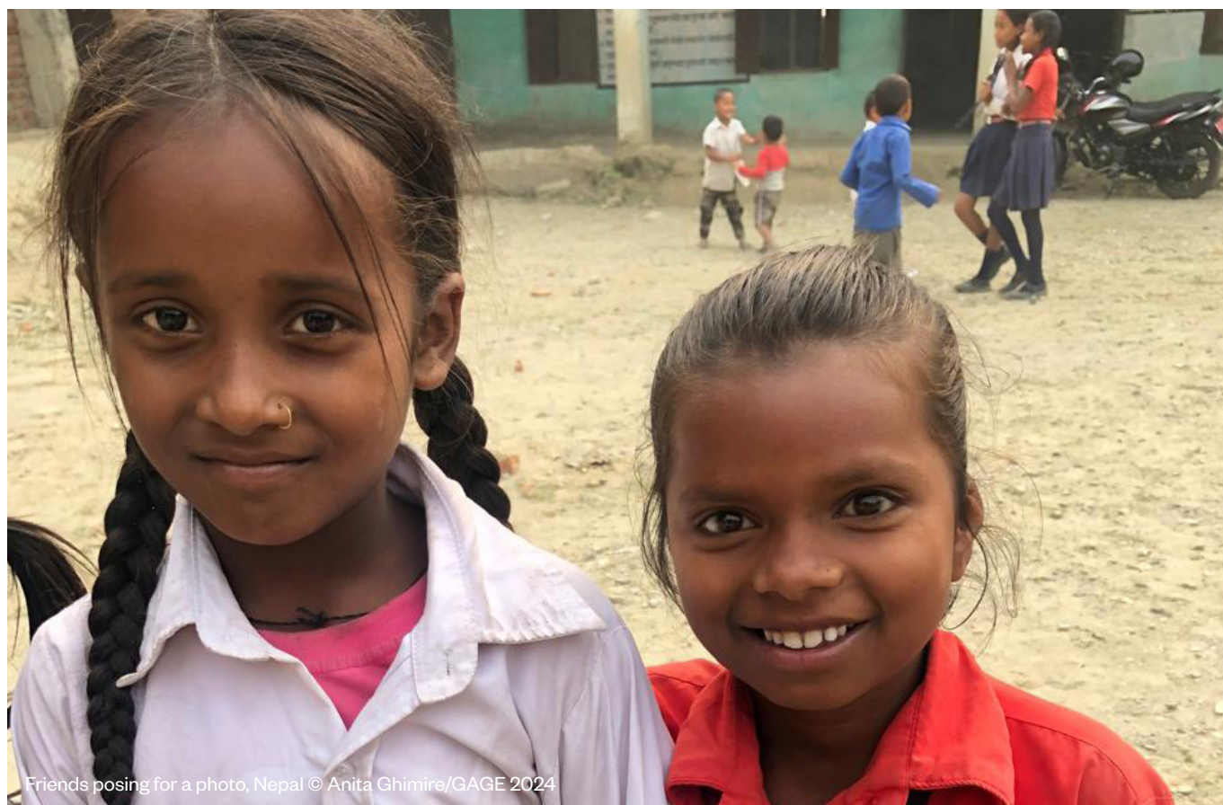
Friends posing for a photo, Nepal

career options linked to various subjects, etc.) before they enter higher secondary education: 'When we are looking for our higher studies, it would be good to have support in counselling. It would be good if the programme tells us which subjects are available in which schools here in grades 11 and 12' (participants in focus group discussion with girls in the treatment group, Tanahun).