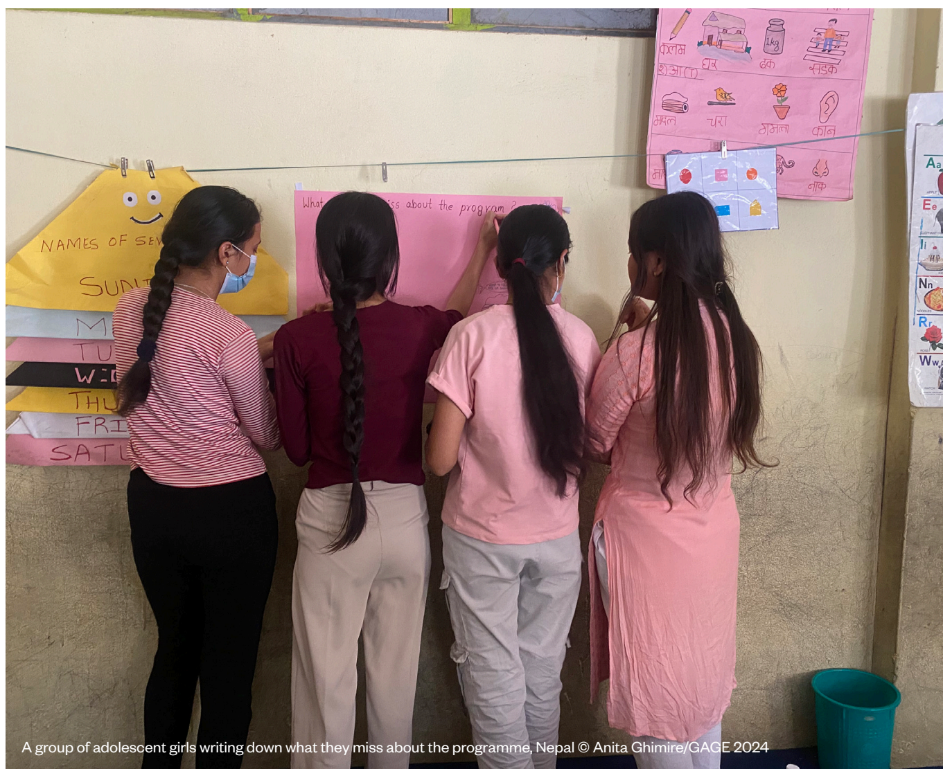
A group of adolescent girls writing down what they miss about the programme, Nepal

A study by Sharma (2022), in Dhanusha and Rautahat districts, finds that girls believed they had equal potential for income-earning activities as boys, but decision-making power remained with the household head.