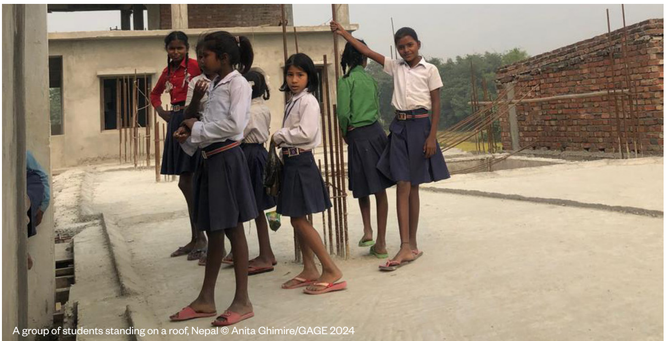
A group of students standing on a roof, Nepal

At baseline, in the month preceding the survey, the largest proportion of girls from both treatment and control groups reported not having visited the playground in the last month; by midline, this had increased to 66% for the treatment group (from 34% at baseline) and 51% (from 42%) for the control group.