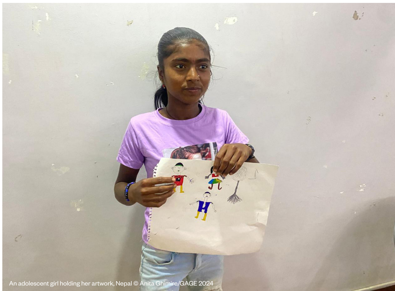
An adolescent girl holding her artwork, Nepal © Anita Ghimire/GAGE 2024

group did not purify water suggesting adolescents had increased access to piped water in 2023.